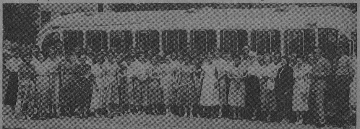
42 students board bus for tour of 20th Century-Fox Studios,

Registration is now open for all girls who are interested in joining one of the three sororities on State campus. The list for Alpha Theta Pi, Delta Beta Sigma and the third, as yet unnamed, are in Ad 221.