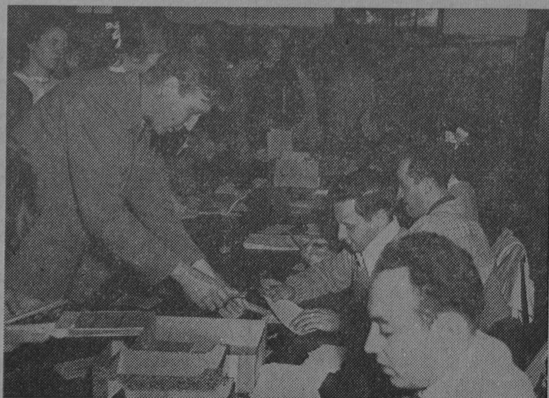
Registration Assistants give students final check. At dead line time 2100 registrants had signed up with more expected later.

Individuals and groups are needed to cooperate in working with existing problems through the world.