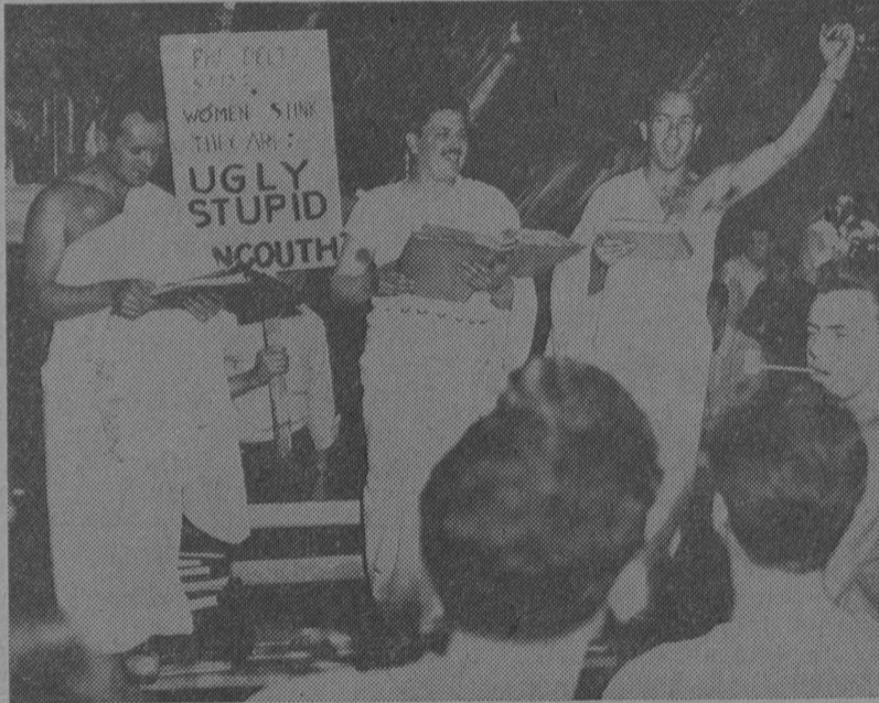
Three Phi Delta members expound on the evils of women to win the award for the best day's activity during Men's Week last year.