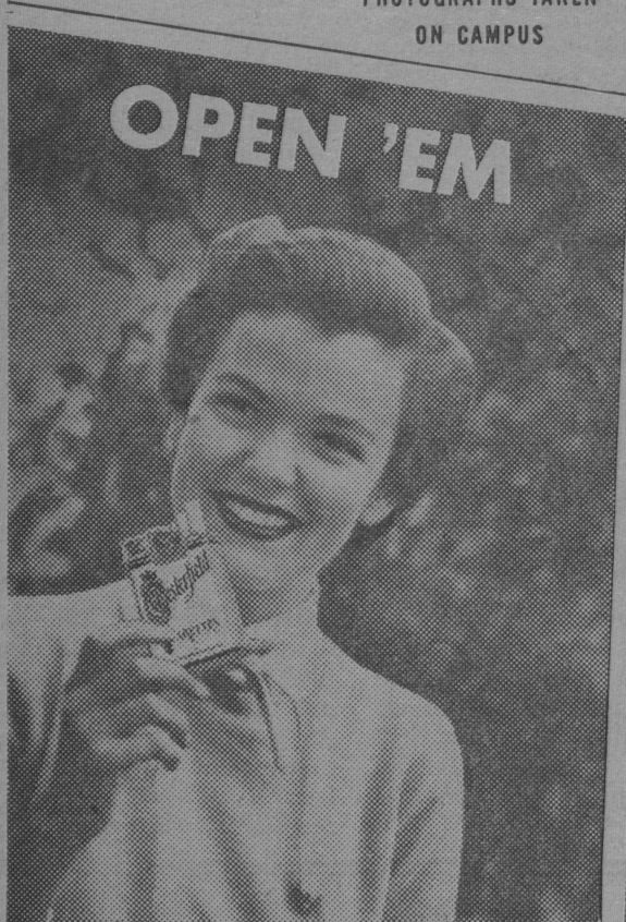
PHOTOGRAPHS TAKEN ON CAMPUS